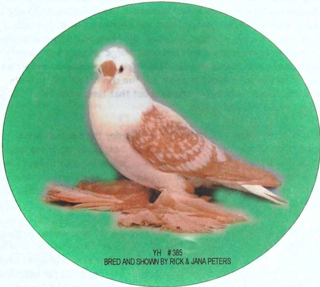
YH #385 BRED AND SHOWN BY RICK & JANA PETERS